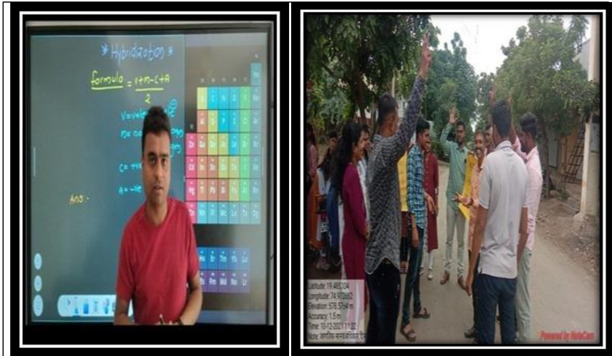
Capability Enhancement Programmes